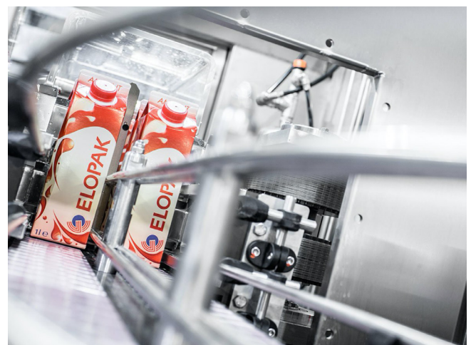
ELOPAK is one of the world's leading manufacturers supplying businesses in the food and beverage industry with complete composite carton packaging systems for liquid and paste-like food products.

Around 70 development engineers at ELOPAK's Monchengladbach site are using SOLIDWORKS for mechanical design and EPLAN Electric P8, EPLAN Fluid and EPLAN Pro Panel for planning the electrical and fluid engineering components of the filling machines. Designers from all disciplines previously used a PLM system to store all product-relevant data.