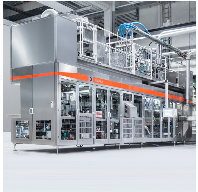
ELOPAK's E-PS120A aseptic filling system enables filling of up to 12,000 cartons per hour for high or low viscosity liquids and into cartons of different designs, sizes and closures.

Outcome: Improved engineering workflows, improved data consistency, increased data quality and process reliability to speed up development and cross-discipline work