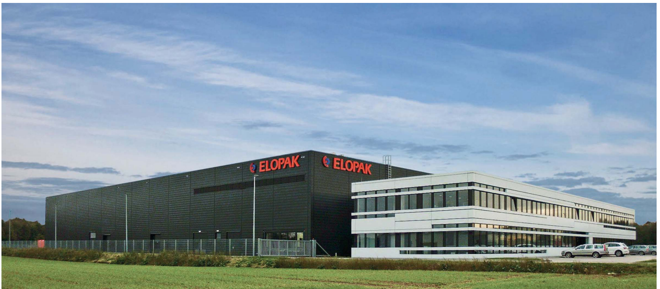
At ELOPAK’s Monchengladbach site, around 70 engineers develop filling systems for beverage cartons.

“I wish all SAP implementation sub-projects were as smooth as CIDEON’s SAP PLM ECTR implementation. Users were very positive about the considerable improvements over the solution they had been using previously.”